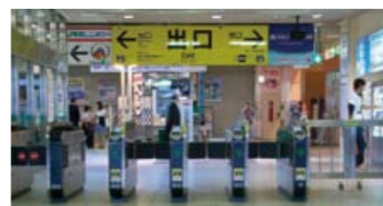
General Ticket Gate