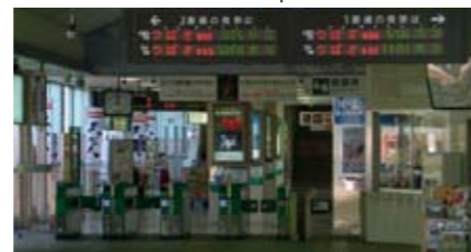
Shinkansen Ticket Gate

Bus Pool No. 1 is the bus stop for Zao Onsen.